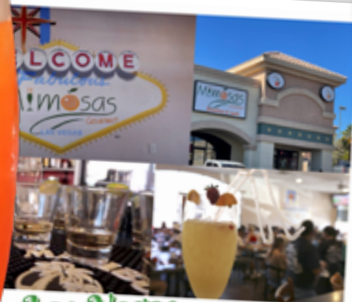
Las Vegas, Durango Drive