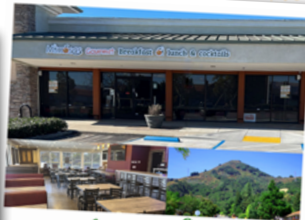
Morgan Hill CA