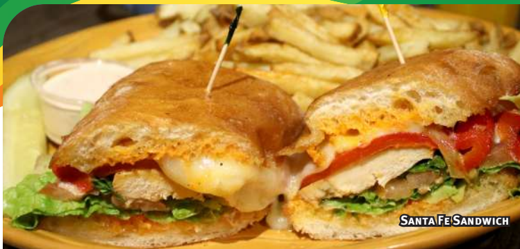
SANTA FE SANDWICH