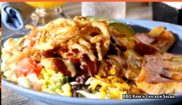
BBQ RANCH CHICKEN SALAD