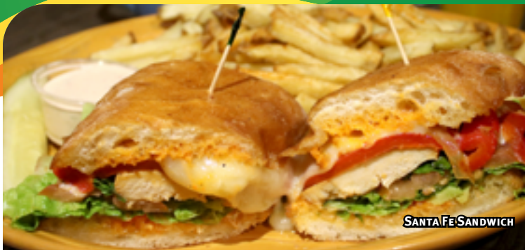
SANTA FE SANDWICH