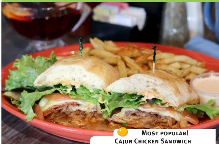
MOST POPULAR! CAJUN CHICKEN SANDWICH