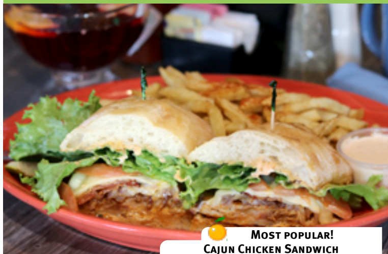
MOST POPULAR! CAJUN CHICKEN SANDWICH