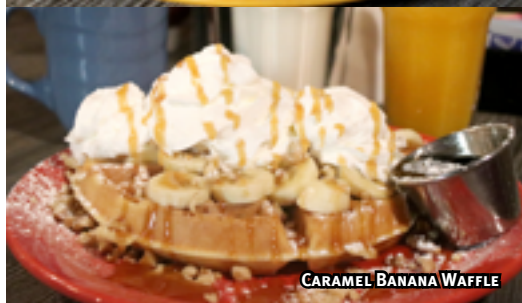
CARAMEL BANANA WAFFLE