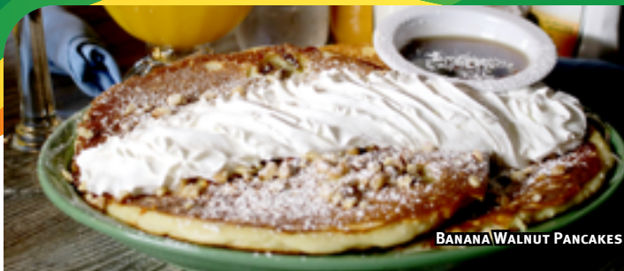
BANANA WALNUT PANCAKES