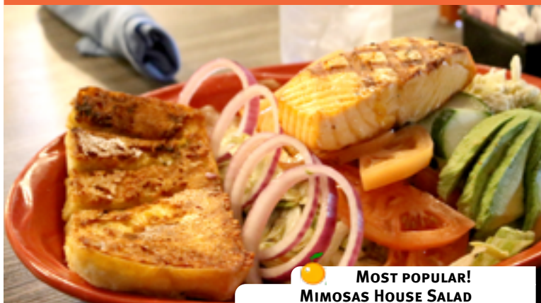
MOST POPULAR! MIMOSAS HOUSE SALAD