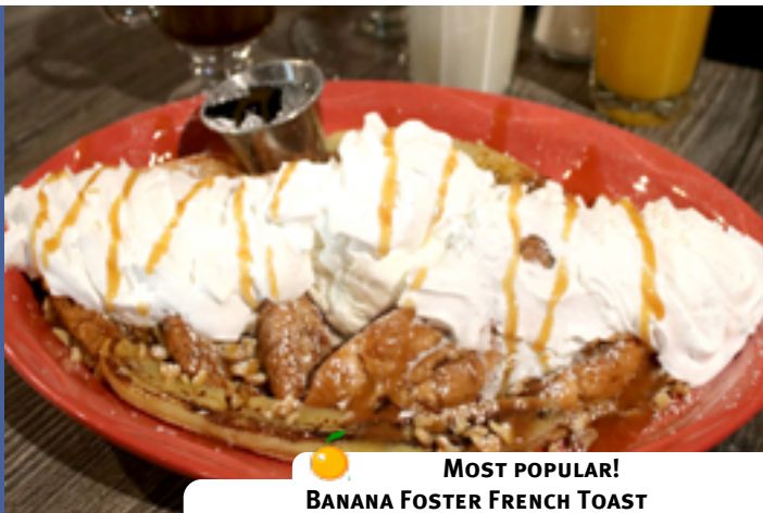
MOST POPULAR! BANANA FOSTER FRENCH TOAST

SERVED WITH FRESH STRAWBERRIES, BANANAS, A SCOOP OF VANILLA BEAN ICE CREAM, TOPPED WITH NUTELLA, WHIPPED CREAM, AND POWDERED SUGAR