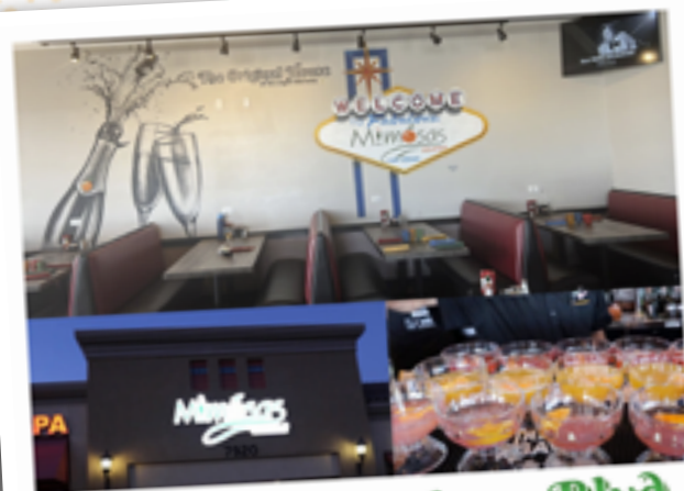
Las Vegas, Rainbow Blvd