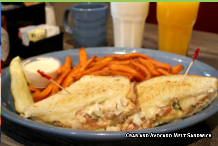
CRAB AND AVOCADO MELT SANDWICH