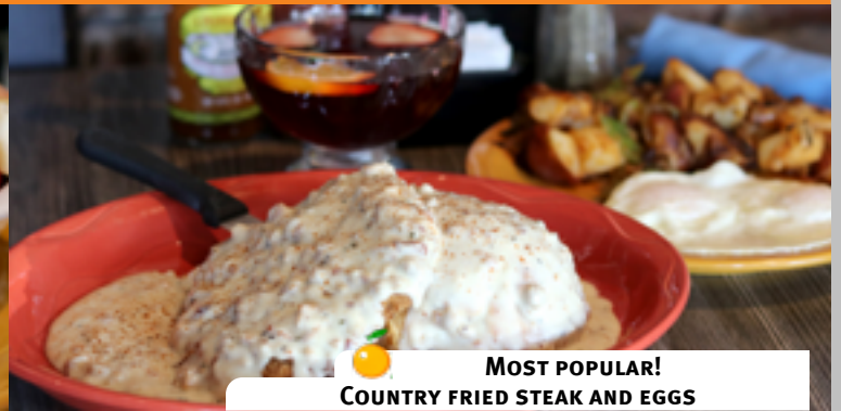
MOST POPULAR! COUNTRY FRIED STEAK AND EGGS