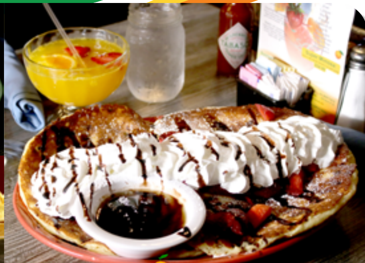
MOST POPULAR! CHOCOLATE CHIP PANCAKES