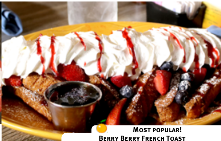
MOST POPULAR! BERRY BERRY FRENCH TOAST