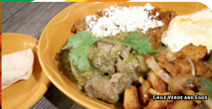
CHILE VERDE AND EGGS