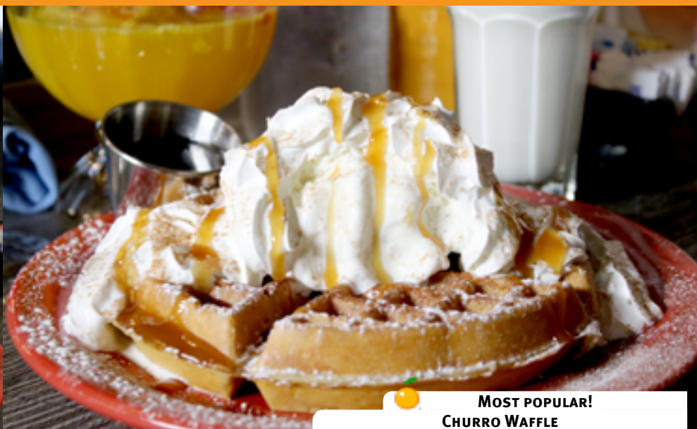
MOST POPULAR! CHURRO WAFFLE