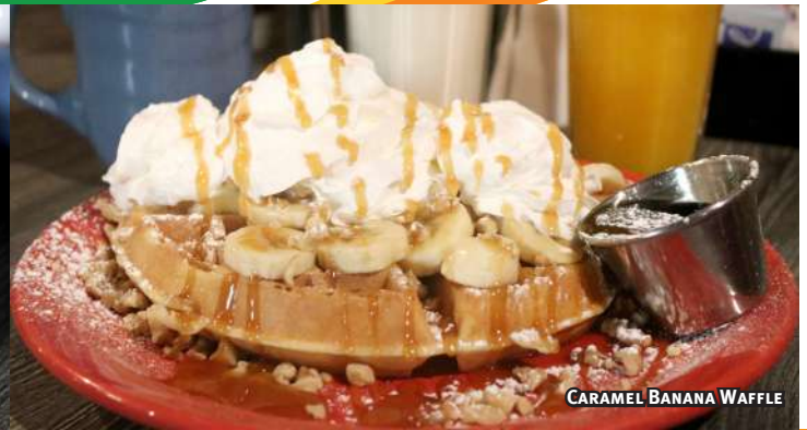
CARAMEL BANANA WAFFLE