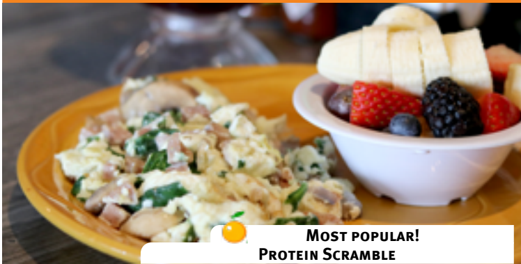
MOST POPULAR! PROTEIN SCRAMBLE

ONE HOMEMADE SUPER BISCUIT, TOPPED WITH COUNTRY SAUSAGE, SCRAMBLED EGGS, AND OUR CREAMY COUNTRY GRAVY (SERVED WITHOUT TOAST)