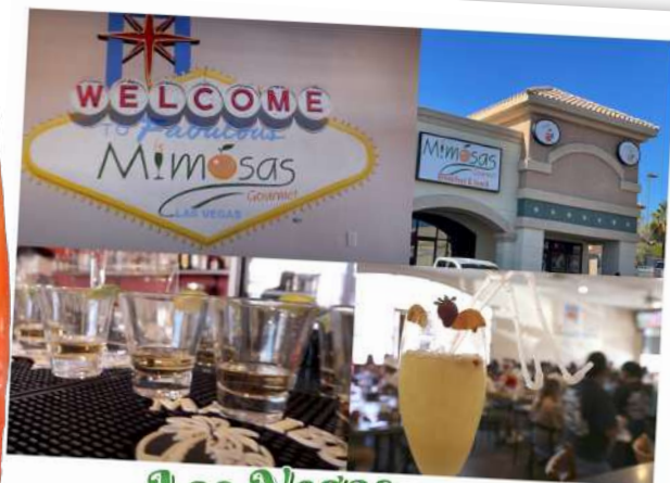
Las Vegas, Durango Drive

Mimosas Gourmet Breakfast, lunch & cocktails