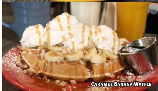
CARAMEL BANANA WAFFLE