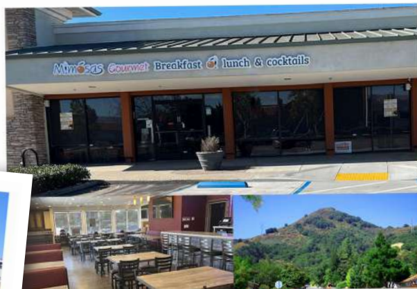
Morgan Hill CA