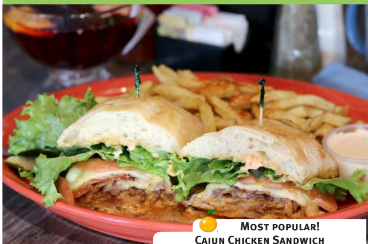
MOST POPULAR! CAJUN CHICKEN SANDWICH