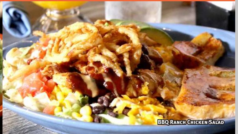
BBQ RANCH CHICKEN SALAD