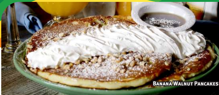
BANANA WALNUT PANCAKES