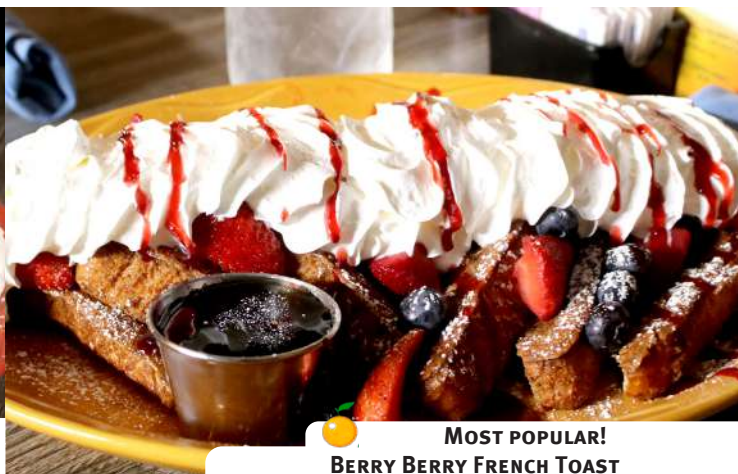
MOST POPULAR! BERRY BERRY FRENCH TOAST