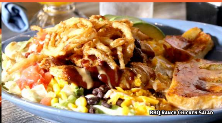
BBQ RANCH CHICKEN SALAD