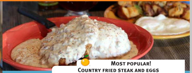
MOST POPULAR! COUNTRY FRIED STEAK AND EGGS