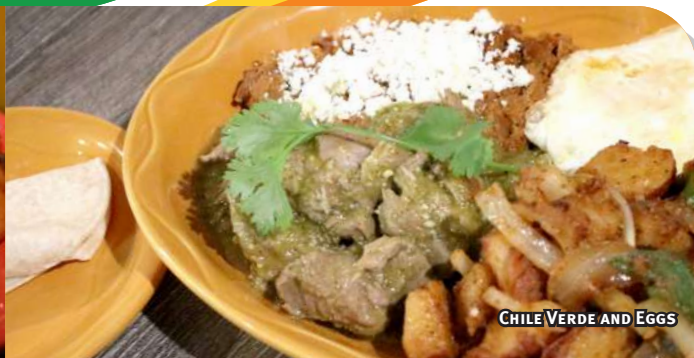
CHILE VERDE AND EGGS