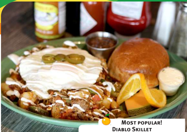
MOST POPULAR! DIABLO SKILLET