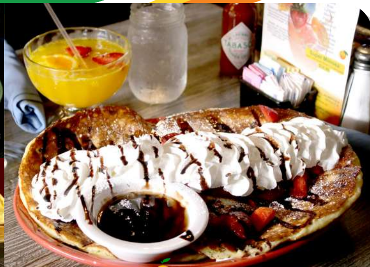
MOST POPULAR! CHOCOLATE CHIP PANCAKES