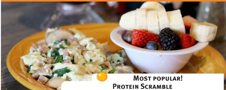
MOST POPULAR! PROTEIN SCRAMBLE