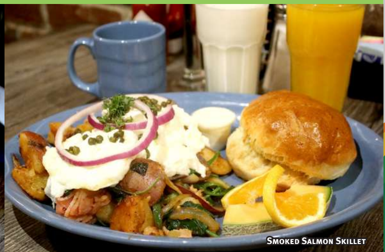
SMOKED SALMON SKILLET