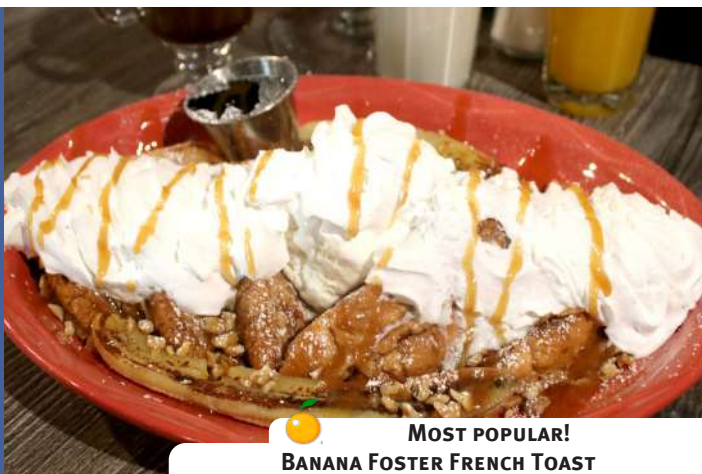
MOST POPULAR! BANANA FOSTER FRENCH TOAST

SERVED WITH FRESH STRAWBERRIES, BANANAS, AND A SCOOP OF VANILLA BEAN ICE CREAM, TOPPED WITH NUTELLA, WHIPPED CREAM, AND POWDERED SUGAR.