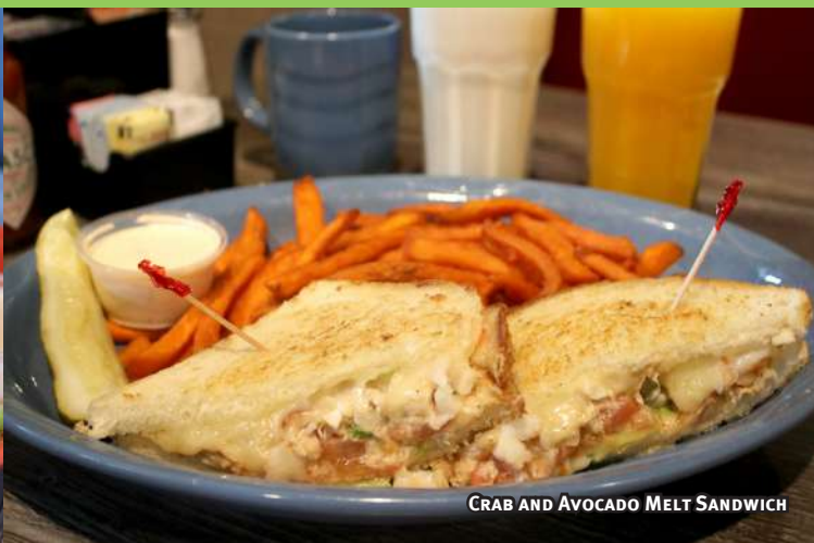
CRAB AND AVOCADO MELT SANDWICH