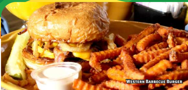
WESTERN BARBECUE BURGER