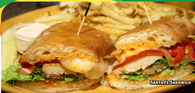
SANTA FE SANDWICH