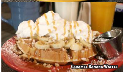
CARAMEL BANANA WAFFLE