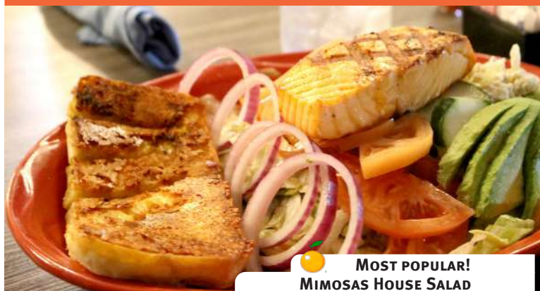
MOST POPULAR! MIMOSAS HOUSE SALAD

PARMESAN CHEESE, CROUTONS, AND CHOPPED ROMAINE, TOSSED WITH CAESAR DRESSING.