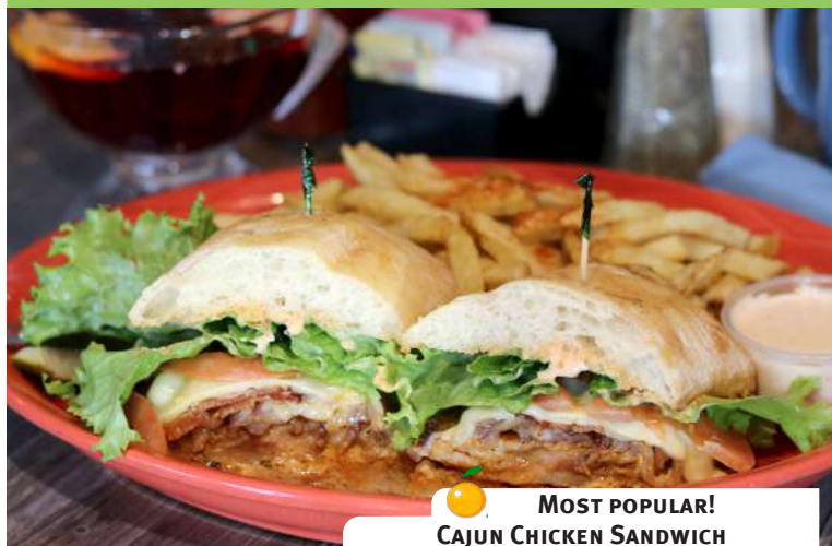
MOST POPULAR! CAJUN CHICKEN SANDWICH