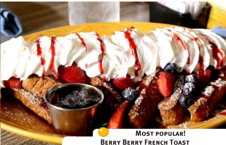
MOST POPULAR! BERRY BERRY FRENCH TOAST